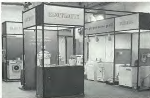
The sectionalised displays used at Helsby and Frodsham.