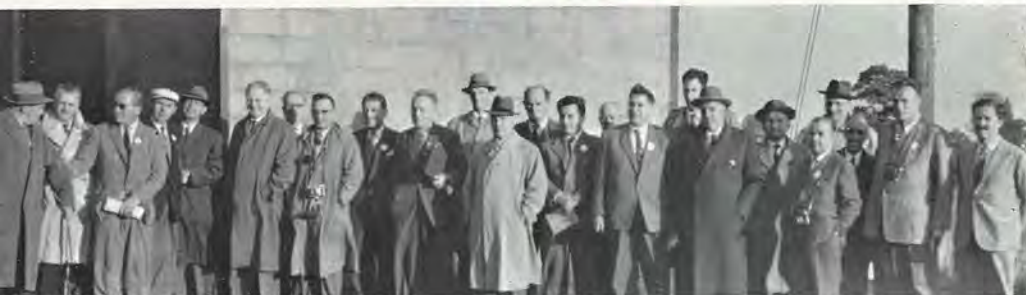
The members of the working party.

The tour of the working party lasted over three weeks, and follows similar visits to Austria, Italy, France and the U.S.S.R.