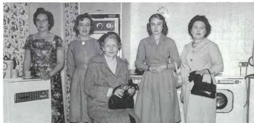
The cast of "The Freedom Kitchen".